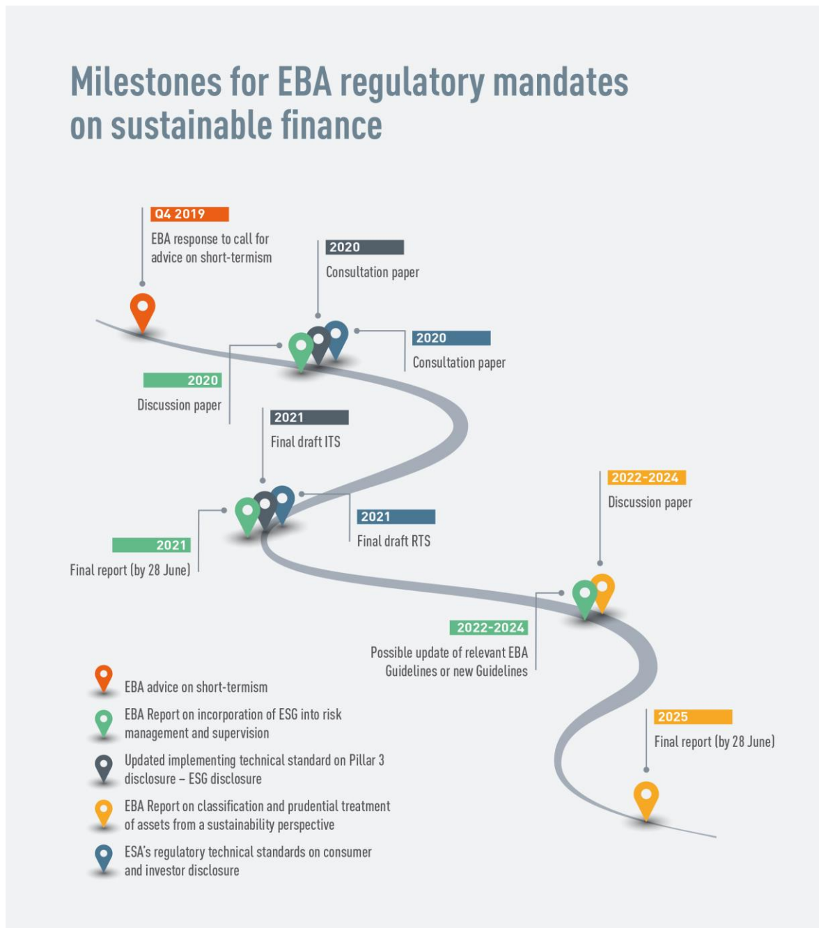
Figure 2: Milestones for EBA regulatory mandates on sustainable finance